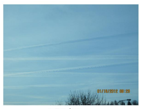
same tree another day