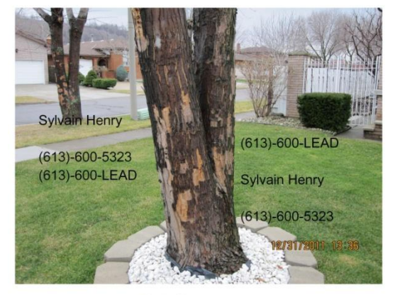
this has to stop today