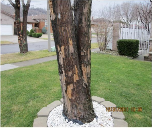
this has to stop today