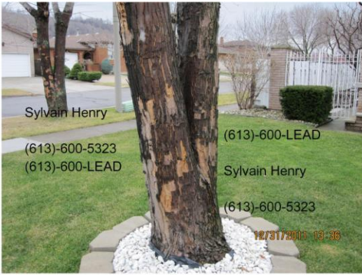
this has to stop today