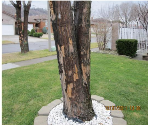
this has to stop today