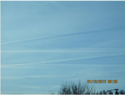
same tree another day