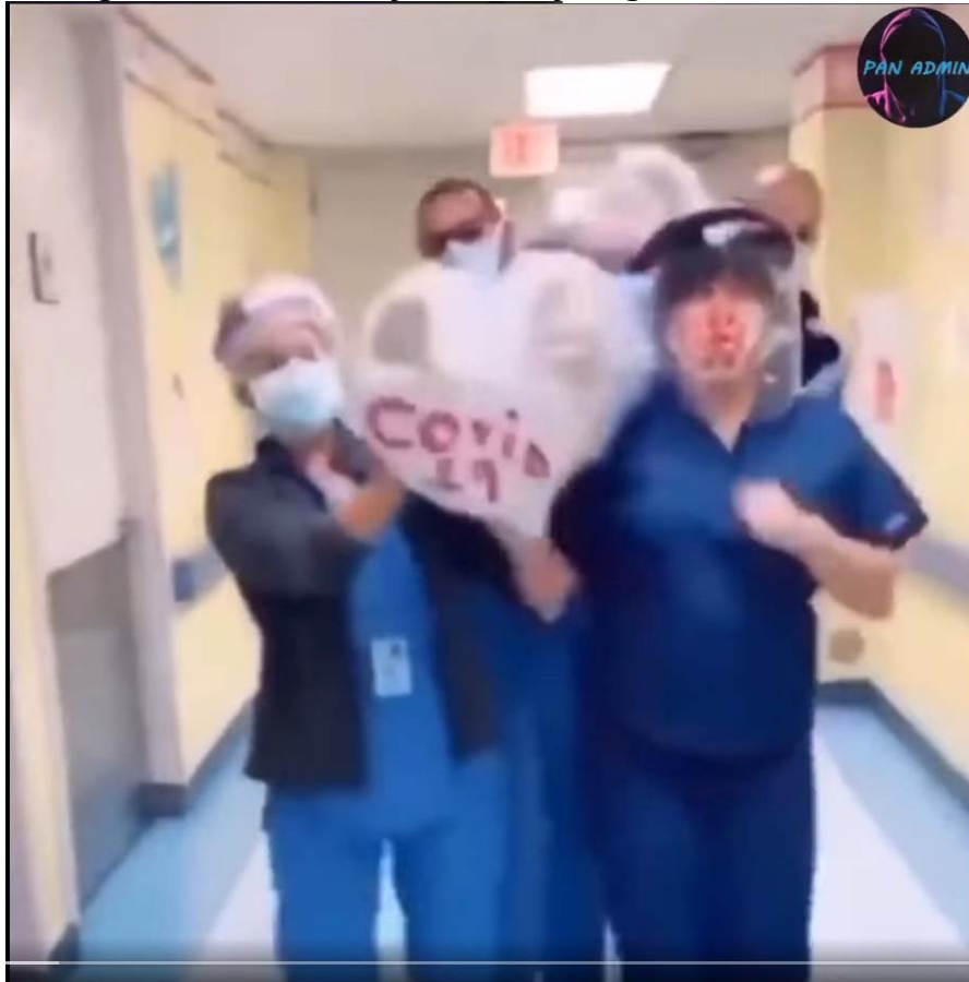
Hospital staff dancing with a dead body in a body bag with "COVID19" written at the feet.